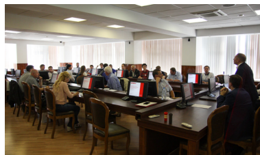
QForm Summer School 2019